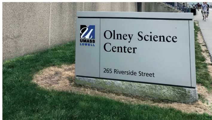
Olney Science Center at the University of Massachusetts Lowell.

Her experience working in industry has provided unique insights into a customer's requirements and enables her to ensure that the NMR facility at the University of Massachusetts Lowell is providing high quality data. Here, she explains the difference it makes to have an instrumentation vendor that goes the extra mile to support all users.