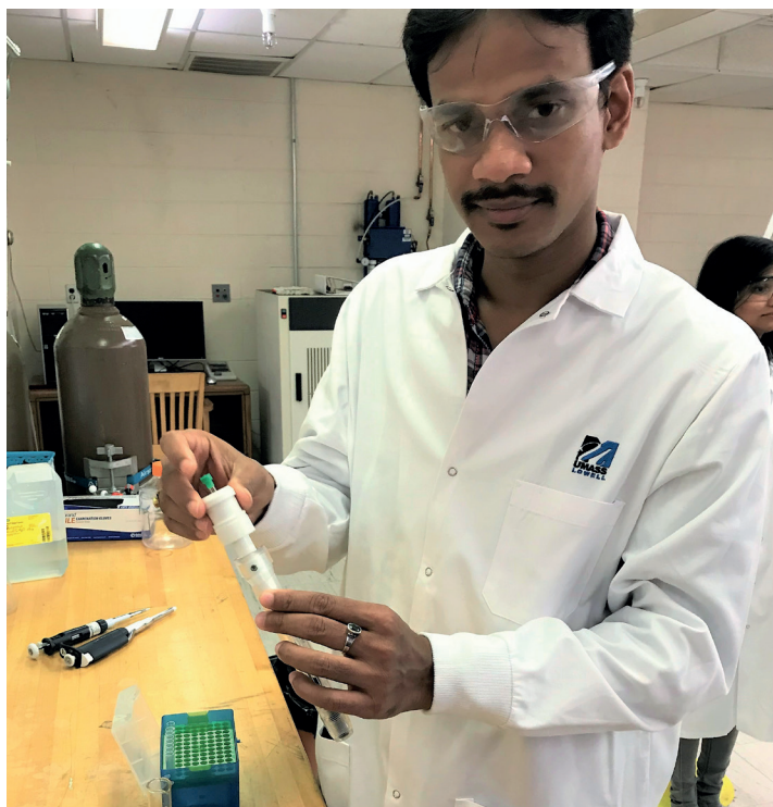
A scientist in the University of Massachusetts Lowell laboratory.

One of our students had been running samples on our other NMR instrument, but he was having difficulty finding the product that he had synthesized. When we ran it on the JEOL 400, he was finally able to identify that he did have product in his sample but only in small quantities. He was very pleased to know that his synthesis was working and he could move forward with his research. It was the increased sensitivity and resolution on the JEOL 400 instrument that enabled this greater level of analysis and provided the answers.